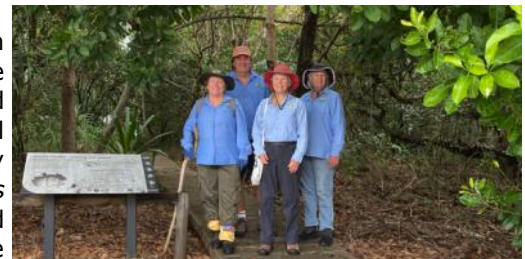
Volunteers seed collecting at Hay Point

Our incredible volunteers have achieved a lot this month! A mountain of pots has been washed and prepared for re-use, most of the tubestock is now weed-free, and plenty of seedlings have been potted up and are growing well. Our Thursday volunteer group took a stroll through the community gardens for some seed collection. They gathered some Cordyline murchisoniae - Murchison's palm lily, Juncus usitatus - Common rush, Dodonaea viscosa - Sticky hopbush and Grewia latifolia - Dogs balls. These seeds were cleaned and sown the following week—ready to kick off a new round of planting. We're also excited to welcome some new faces to the team, as well as a few familiar ones returning. Thanks to everyone who's lent a hand—your energy and dedication keep everything thriving!