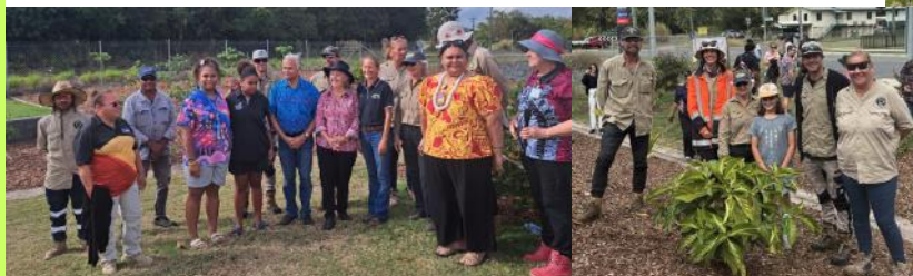
Yuwi, Sarina Hospital, SLCMA staff and volunteers