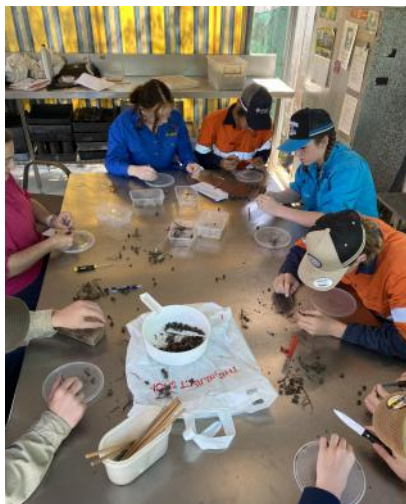
SSHS students joining in Propagation workshop

On August 26th, we were very pleased to welcome 13 students from Sarina State High School for a hands-on Propagation Workshop to compliment their studies in Certificate I in Agriculture.