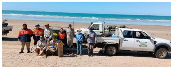
Thanks to the survey team for their help :)

SLCMA is working together with Yuwi Rangers and QPWS to tackle marine debris at Cape Palmerston National Park. To date we have undertaken marine debris survey training with Tangaroa Blue and have begun regular marine debris monitoring surveys at Cape Palmerston, will collect vital data to help inform future conservation efforts.