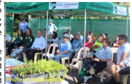
Attendees at the celebration