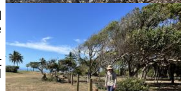
Top to bottom: * Old bollards and new bollards * Old wire fence and new fence