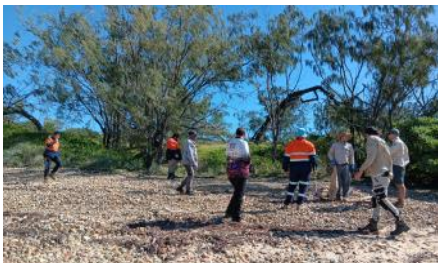
Setting up transects, ready to collect marine debris

We are now gearing up for the first of four Community Clean-Up events, which will take place on Monday 16th June at Cape Palmerston. These events are more than just clean-ups—they're a call to action and an opportunity to educate and empower the community. Participants will be removing significant volumes of rubbish from the stunning beaches of Cape Palmerston, helping to restore and protect this unique coastal environment for future generations.