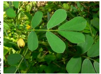
Above: Sicklepod with distinguishing 3 pairs of leaflets Below: Sicklepod 'sickle-shaped' seed in development

Please call the SLCMA office (4956 1388) or email admin@sarinalandcare.org.au to express interest and to check your eligibility. The Land for Wildlife Program is supported by Mackay Regional Council Natural Environment Levy.