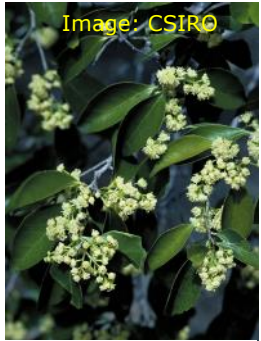
Above: Flowers & leaves Below: Attractive new growth of leaves