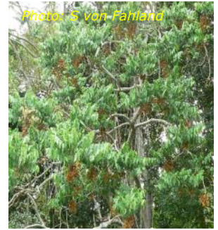
Fruit & leaves of Ivory Mahogany

Notes: Fast growing, attracts birds. Odour of stem sometimes faint, resembling shallots or beans.