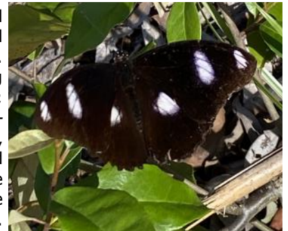
Male Eggfly butterfly ( Hypolimnas sp.) in the gardens

plants thrive in wetter conditions, they also cope well during the dryer months. We look forward to these plants growing and creating a new display for visitors to the gardens.