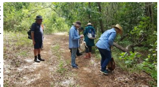
SLCMA Volunteers seed collecting

As announced in our last newsletter, our nursery will be expanding, and phase 1 has begun! The water treatment train currently located at the rear of the nursery has been dismantled and set in a temporary location until a new setting is constructed on the proposed extended site. We will give you an update on phase 1 in the next newsletter.