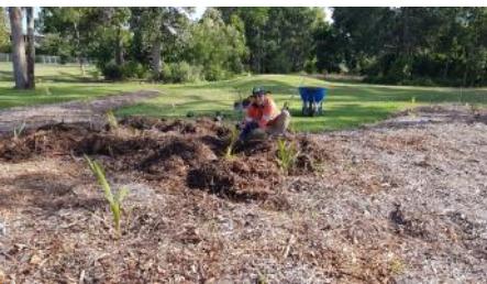
Larissa planting 'Frogmouth'

A new garden bed has recently been added to our community garden. We have named it the Boomerang Garden due to its shape. This is quite a wet spot, so we are planting species that love these boggy conditions; Broad-leaved paperbark ( Melaleuca viridiflora ), Cabbage tree palm ( Livistona decora ), Frogmouth ( Philydrum anuginosum ) and Crinum lily ( Crinum pedunculata ); are some of the species recently added. While these