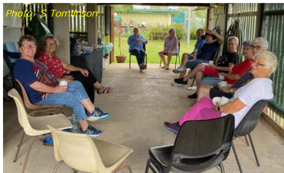
Volunteers enjoying our volunteer Christmas party!

If you would like to volunteer in your local community and meet new people while learning local native plants and their propagation, come along to the SLCMA Community Volunteer morning, every Wednesday, 9am to 12noon. For more details contact SLCMA on 4956 1388. SLCMA Community Volunteer Program is proudly supported by Mackay Regional Council, Natural Environment Levy.