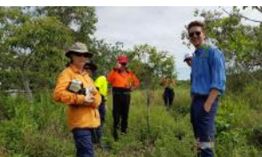
Staff from SLCMA, MRC & CVA meet at Louisa Creek Reserve

Rehabilitation of Louisa Creek Reserve: SLCMA will work in partnership with Mackay Regional Council and the community including Conservation Volunteers Australia, to undertake rehabilitation activities within the Louisa Creek Reserve. Louisa Creek Reserve is registered with the Land for Wildlife Program and is a valuable section of coastal environment providing a buffer between residential land and important mangrove and estuarine habitat. We look forward to working with the community to undertake activities such as revegetation, weed control and litter collection and raising awareness about the importance of coastal areas.