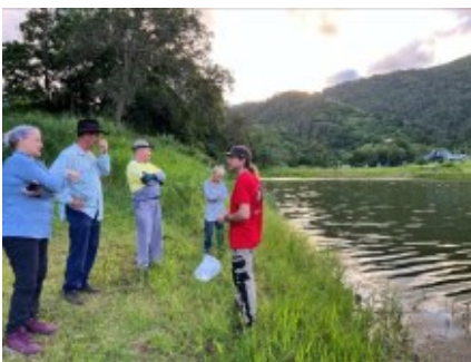
Toad busting workshop

The Land for Wildlife program is delivered within the Mackay Regional Council boundaries of the Sarina Catchment by SLCMA and the Pioneer Catchment by Pioneer Catchment and Landcare Group (PCL); on behalf of the Mackay Regional Council Natural Environment Program. This coordinated approach provides consistency across the region and beneficial linkages to other complimentary projects and programs.