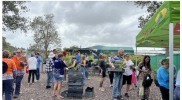
Sarina free native plant giveaway 2024