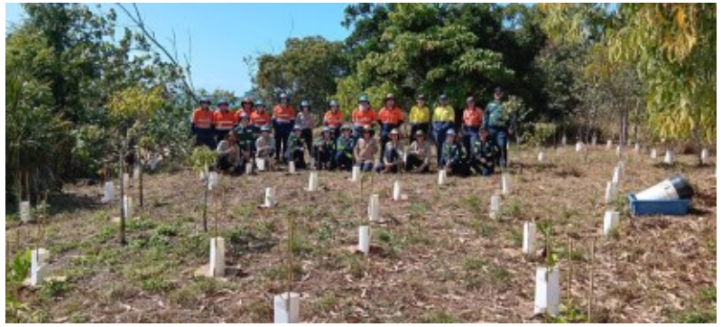
National Tree Day 2024, Louisa Creek Reserve

Over the last few years, it has also been chosen as a site for National Tree Day, through a partnership with Dalrymple Bay Coal Terminal PL (DBCTPL) and Mackay Regional Council (MRC). Together, we have been able to extend previous NTD plantings and continue the rehabilitation of the site.