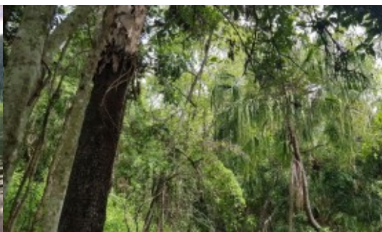
Habitat under LfW program