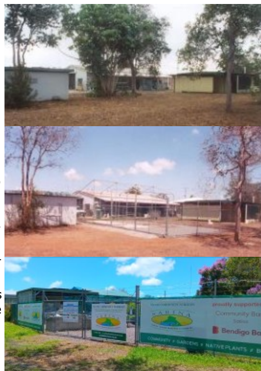
Top: before nursery (2003)