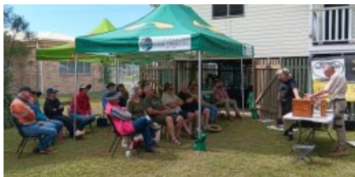
Native Bee workshop

A membership with SLCMA has many rewards: