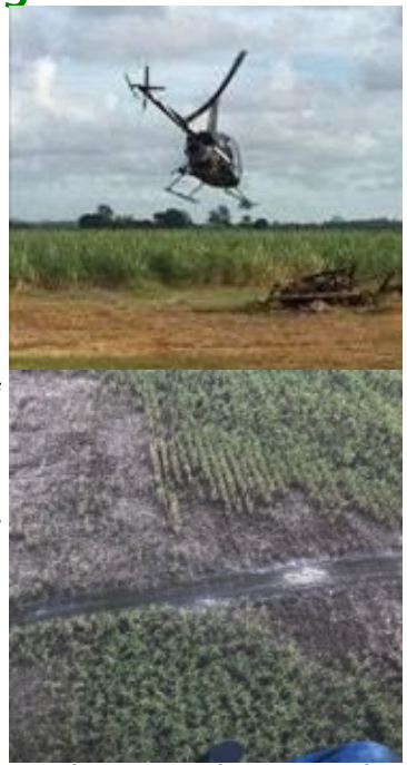
Above: pig damage within sugar cane

June 2023-810kg, June 2024-400kg, June 2025-200kg; of garden weeds removed by volunteers