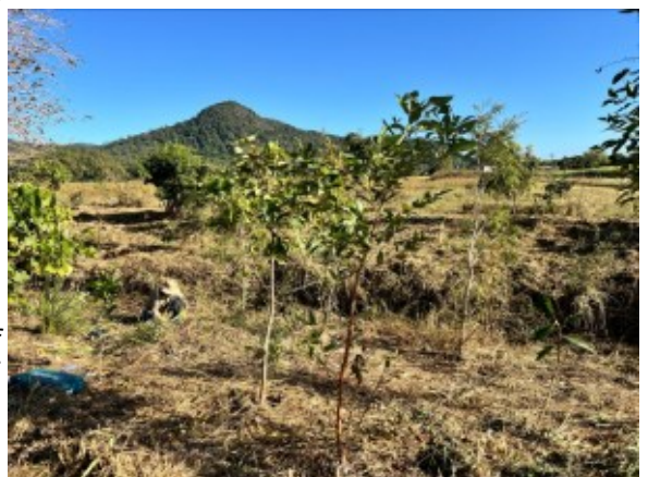
Creating Koala habitat corridors