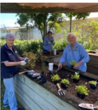
Right: SLCMA educational precinct including SLCMA Community Nursery, SLCMA Office and Sarina Community Native Gardens