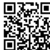
QR code for local CQCLN plant database

The wildlife database provides images and information about native wildlife you are likely to encounter across the Mackay Whitsunday region.