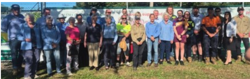
Volunteers, SLCMA staff and supporters celebrating the opening of the SLCMA Community Nursery expansion

We are very excited to be able to continue our nursery upgrades over the next 12 months with news that we were successful in applying for funding through the Mackay Regional Council Infrastructure Grant Program and Gambling Community Benefit Fund —to expand our workspace by installing two shade structures.