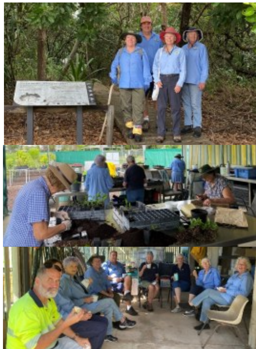
Volunteers enjoying seed collecting, nursery work and morning tea