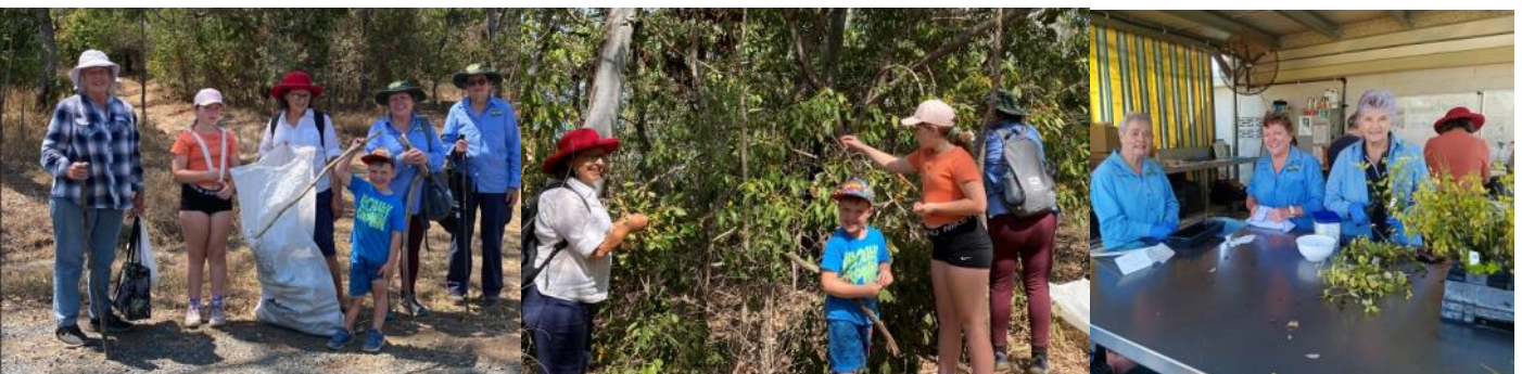
Volunteers ..... collecting rubbish ..... seed collecting ..... cleaning seed :)

Are you eager to dive into your local community, connect with new friends, and discover the fascinating world of native plants and their propagation? Join us for the SLCMA Community Volunteer Morning every Wednesday from 9am to 12noon. It's a wonderful opportunity to learn, grow, and contribute! For more information, give us a call on 4956 1388. Get involved and make a difference! The SLCMA Community Volunteer Program is proudly supported by the Mackay Regional Council's Natural Environment Levy.