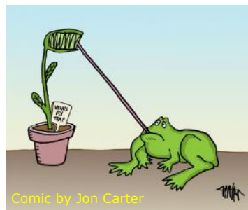
Comic by Jon Carter

Q- Why did the wattle tree break up with the gum tree? A- It couldn't handle the "eucalyptus" in the relationship!