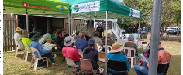
Below: Thanks to Vicki from Coffee Van Go—Espresso for keep our attendees boosted with energy