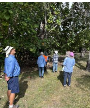
Volunteers on the search for ripe native seed

This month's field trip, saw our volunteers enjoy a walk along the Sarina Inlet Trail