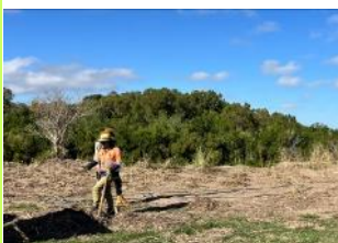
Field team same site sunshine & rain ;)

The SLCMA Field Team get to enjoy all the different weather that nature throws at them ....while onsite helping landholders to rehabilitate their waterways and build stability and resilience in their creekbanks through the Queensland Government Reef Assist Program.