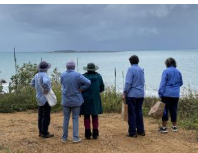
Volunteers enjoy the views at Grasstree Beach headland

Our seed collecting trip for May was to the Grasstree Beach headland. We walked along the tracks to Whites Beach collecting seed from Helichrysum lanuginosum - White paper daisy, Lophostemon confertus - Brush box, Pimelea cornucopiae - Rice flower and Thespesia populneoides - Tulip tree. The headland track was an enjoyable walk with glorious views highlighted by the blooms of Acacia flavescens - Yellow wattle, Acacia leptocarpa - North coast wattle and Melaleuca viridiflora —Broad leaved paperbark. We all enjoyed a much needed hot cuppa and a treat for morning tea afterwards which eased our damp state from getting caught in a refreshing light shower of rain ;)