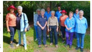
Our nursery volunteers enjoyed a morning tea to celebrate Volunteer week

Thank you all for lending a hand and choosing to spend your time with us to help make a difference :)