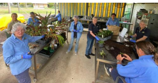
Left: Nursery volunteers having fun with our plants during a volunteer morning

If you would like to volunteer in your local community and meet new people while learning about local native plants and their propagation, come along to the SLCMA Community Volunteer morning, every Wednesday, 9am to 12noon. For more details contact SLCMA on 4956 1388. The SLCMA Community Volunteer Program is proudly supported by Mackay Regional Council, Natural Environment Levy.