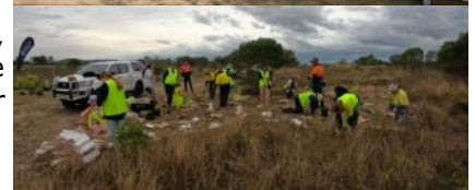
Top: Collaborating with partners, Middle: SLCMA display, Bottom: Community planting