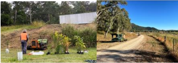
Weed control and planting on local properties

Our field team have already planted over 1,500 koala food and habitat plants on private properties throughout the Sarina region. These plants were nurtured in our very own Community Nursery. Additionally, we have conducted targeted weed control across approximately 20 hectares. Local businesses have also played a crucial role in our progress; for instance, Xtream (Extream Green Clearing & Maintenance's) Green's remote-controlled mulcher has been invaluable for weed control and site preparation.