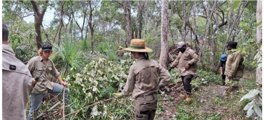
Uncleared area (on the left) as against cleared area (below)