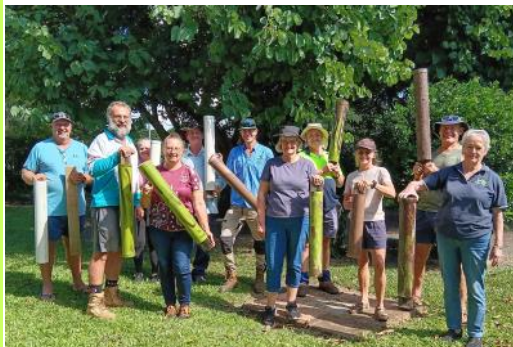
Workshop participants displaying their microbat habitat pipes

For further information about bats and how to protect them, feel free to contact us or check out these handy websites: