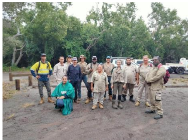
Group photo of our great team