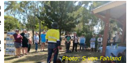
Above: Community meet & greet Below: fox prints at Cape Palmerston

This event has received funding support from the Queensland Government's Community Sustainability Action grant program.