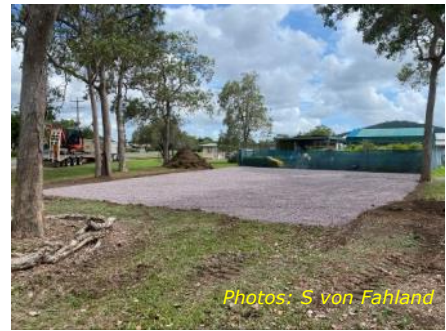
Sarina Mini Excavators undertaking ground preparations