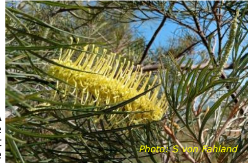
White flowering variety of Grevillea banksii

The "Plant of the Month" is currently available from the SLCMA Community Nursery. Landcare members are eligible to receive 1 free "Plant of the Month", throughout that month. This and other native plant species are also available for purchase at $3.30 each. All plants are grown from locally sourced seed in the SLCMA Community Nursery by SLCMA staff and the SLCMA Volunteer team.