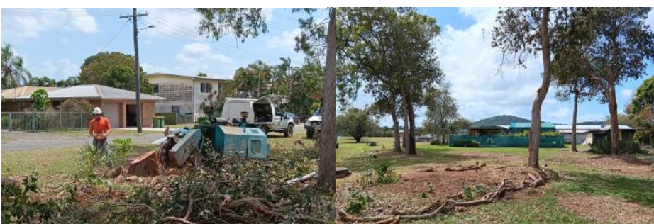
Stump grinding, vegetation removed and pruned and, fresh mulch for the gardens