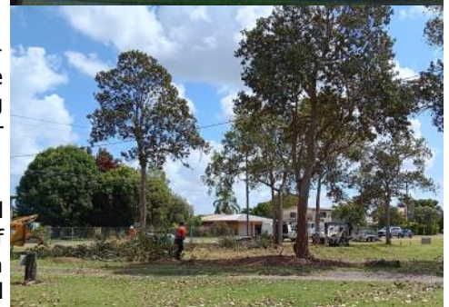
Above: Before & after vegetation removal & pruning