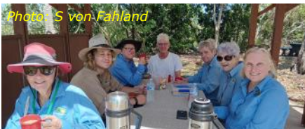
Our volunteers enjoying morning tea out & about after seed collecting

If you would like to volunteer in your local community and meet new people while learning local native plants and their propagation, come along to the SLCMA Community Volunteer morning, every Wednesday, 9am to 12noon. For more details contact SLCMA on 4956 1388. SLCMA Community Volunteer Program is proudly supported by Mackay Regional Council, Natural Environment Levy.