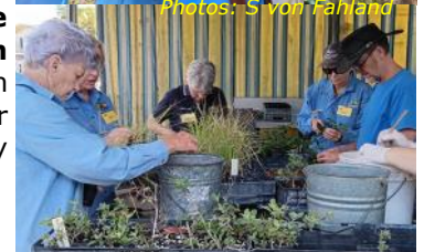
Top: The 'fruits' of one of our seed collection trips ;) Middle: It's a team effort collecting seed, thank you to our volunteers! Bottom: Some fun in the nursery