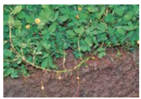
Arachis pintoi cv. Amarillo (1987)