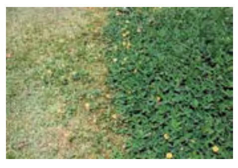
Arachis glabrata cv. Prine (1995)

Both Pinto and Rhizome forage peanut are strongly-perennial herbaceous legumes. Both are multi-purpose legumes for grazing, hay, and ground cover for horticulture and tree crops.