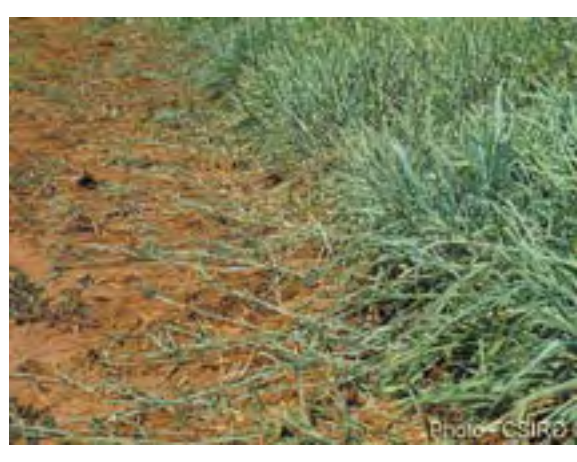
Digitaria millianjiana cvv. Jarra (1991), Strickland (1995), Arnham, NT (1996)