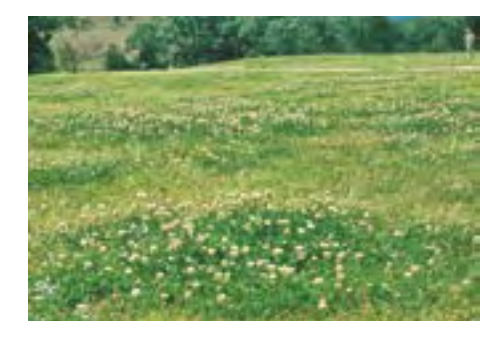
Trifolium semipilosum cv. Safari (1973) common name Kenya white clover

Clare subterranean clover is a true annual that can be sown as a legume component with rye grass for autumn through spring feed on tableland areas, where moisture is available. There is a need to use high sub-clover seeding rates (10 to14 kg per hectare) to provide quick pasture grazing.