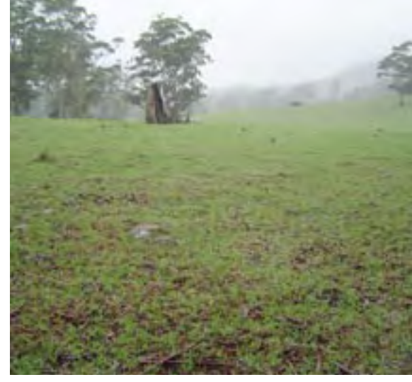
Heavily grazed kikuyu grass pastures on Eungella tableland.

Management recommendations: Suitable for pasture improvement