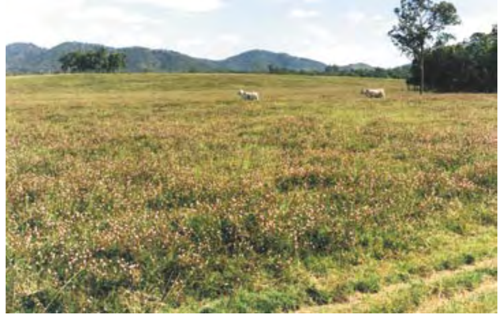
Sensitive weed (Mimosa pudica) in run down sown pastures. Sensitive weed is a naturalised legume that adds a lot of nitrogen to the soil and pasture system but its dominance is a symptom of heavy continuous grazing and/or rundown in soil fertility, particularly phosphorus.

coastal pasture systems. Today the new stylos and the four jointvetch legumes offer better persistence and production options for sustainable pasture systems. The most recent centro (Cardillo) is promising; it roots down much more at the nodes forming a denser sward and climbs less than common centro.