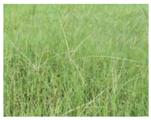
Digitaria eriantha subsp. pentzii cv. Pangola, (formally D. decumbens )

Pangola was released in Australia in 1962, following testing of vegetative material from Hawaii, and previously released in Florida, USA in 1943, following testing of vegetative material from South Africa.