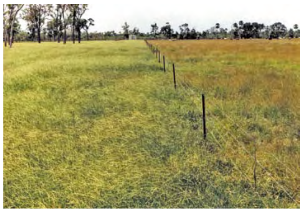
The continuously grazed and ageing paddock of Callide rhodes grass (right) has been invaded by Parramatta grass, a weedy sporobolus grass. The pangola grass (on the left) remains weed free.)

condition, and subsequently, declining animal production. If repeated annually, the land and enterprise income earning capacity will decline and remedial management costs will greatly increase.