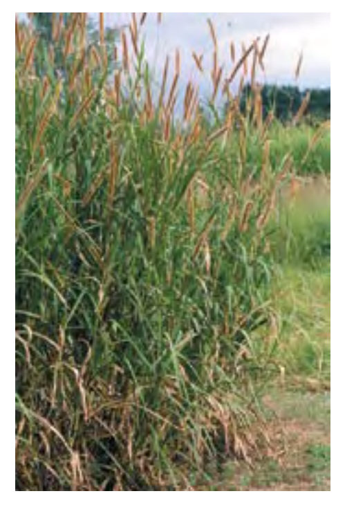
Pennisetum purpureum cv. Capricorn (1962)