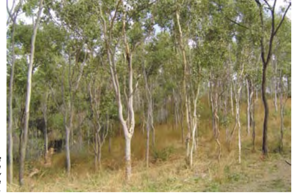
Mixed eucalypt vegetation on range country in Brightly area west of Eton.