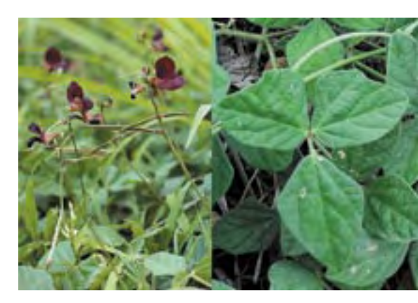
(Macroptilium atropurpureum cvv. Siratro (1971), Aztec (1994), retailed as Aztec-atro

Siratro is an herbaceous, perennial legume, with trailing, climbing, twinning stems and with a swollen taproot once established. The original Siratro was a foundation legume for early tropical sown pasture development in the MW region during the late 1960s and 1970s. Although it establishes and grows quickly it is susceptible to waterlogging, continuous grazing and to leaf rust. It has poor persistence in continuously grazed sown pastures, particularly in coastal tea tree country. It is a climbing legume and can potentially become a nuisance weed in tree crops, in the absence of grazing.