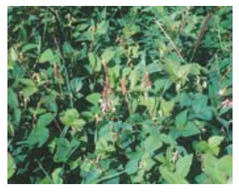
Desmodium intortum cv. Greenleaf (1964)