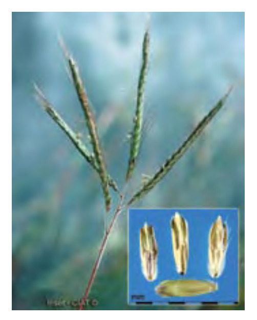
Dichanthium aristatum cv Floren (1995), Bloomsbury strain angleton grass (1960s)