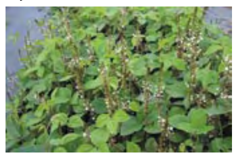
Neonotonia wightii cvv. Tinaroo (1962), Clarence (1962), Cooper (1962), Malawi (1976)

Glycine is a strong, deep rooting legume with long branched and trailing/climbing stems. It was used extensively during the 1970s and 1980s as a legume in dairy pastures. It demands high amounts of nutrients, a long growing season and can tolerate cooler weather than most tropical legumes. Glycine grows best in well drained, moderately fertile soils in tableland areas, including Atherton and Eungella where the Tinaroo variety is mostly used. Although a considerable amount of glycine still persists in pastures around the MW region, it is now seldom sown due to its aggressive climbing habit, which can make it an environmental problem 'weed' in tree crops and ungrazed situations such as new subdivisions and housing estates.