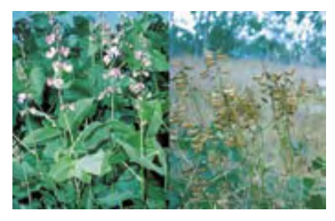
Lablab purpureus cvv. Rongai (1962), Highworth (1973), Endurance (on pre-release)

Lablab is a vigorous herbaceous, prostrate to semi-erect, climbing, annual legume grown mainly for grazing forage or as a green manure crop. It has a longer autumn growing season then cowpea and has better resistance to Phytophthora root and stem rot, and to insect attack. Endurance is a perennial lablab but had poor seedling vigour and not much was planted.