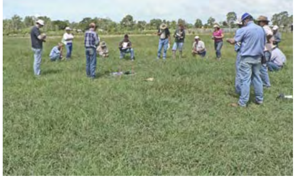
Grazing Land Management and Stocktake workshops introduce land owners and managers to a range of grazing management options and tools that can be adapted and applied to suit their own property conditions.

(managing grazing, using sown and native pastures, managing weeds, managing tree-grass balance, using fire)