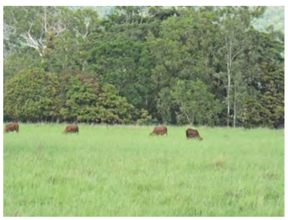
A well grassed small alluvial flat adjacent to a well vegetated stream