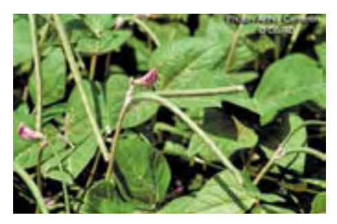
Vigna unguiculata cvv. Ebony PR (1996), Arafura, Meringa, Red Caloona (1975), Kalkie

Cowpea is an herbaceous, semi-erect, climbing, annual forage legume and is one of most widely used legumes throughout the tropical world. Ebony PR, Arafura and Meringa are later maturing (longer growing season) forage types while Red Caloona is a faster maturing grain and forage dualpurpose variety.