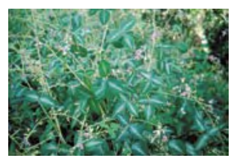
Desmodium uncinatum cv. Silverleaf (1971)

Greenleaf and Silverleaf desmodiums are large trailing and scrambling, short to moderately lived perennial legumes suited to cool tableland areas in the tropics. The plants lower stems root at the nodes when in contact with moist soil and can be planted vegetatively using rooted cuttings. Both were important pasture legumes for dairy cattle at Eungella and Sarina range during the 1970s and 1980s. Greenleaf and Silverleaf desmodiums are now