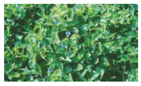
Vigna parkeri cv. Shaw (1984)

Creeping vigna is a perennial legume with climbing and prostrate stems, which root at the nodes and form dense ground cover. It is suitable for sandy to well drained red clay soils in subtropical and tropical tableland areas. The best growth for creeping vigna occurs during moist periods in autumn and spring. It has been successfully grown with kikuyu grass on Eungella Tableland dairy farms but requires careful management during establishment and second years (periodic moderate grazing to reduce competition from companion grasses to ensure long term legume persistence).