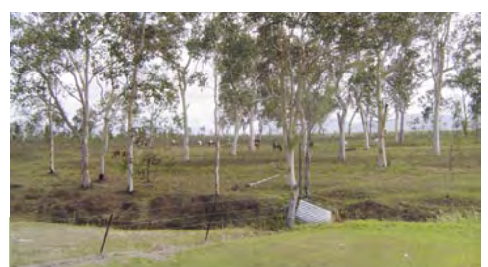
Poplar gum can occur on hills and flats; this is a poplar gum dominant flat north west of Kinchant dam.

Recommended conservation values: Conservation rating 'of concern' and a biodiversity rating 'endangered'. A diverse vegetation unit which has been poorly surveyed for flora and fauna. Significant fauna species include the black-chinned honeyeater, squirrel glider and koala. Conservative grazing regime to allow recruitment of canopy species. Appropriate fire regime to maintain eucalypt community.