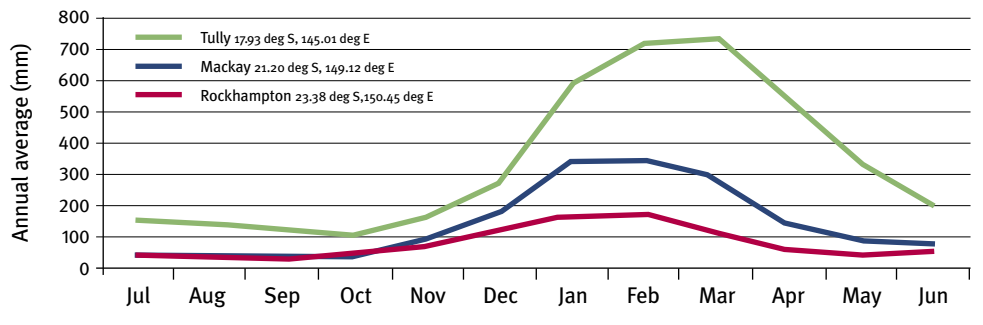
Figure 2: Mean monthly rainfall graphed to show seasonal forage growth cycle for Tully, Mackay and Rockhampton

of December and March. Table 1 presents mean monthly rainfall data for six sites in the region plus Tully and Rockhampton. Figure 2 graphs monthly rainfall to show and compare potential seasonal forage growth cycle for Tully (northern wet tropics), Mackay and Rockhampton (drier central tropics).