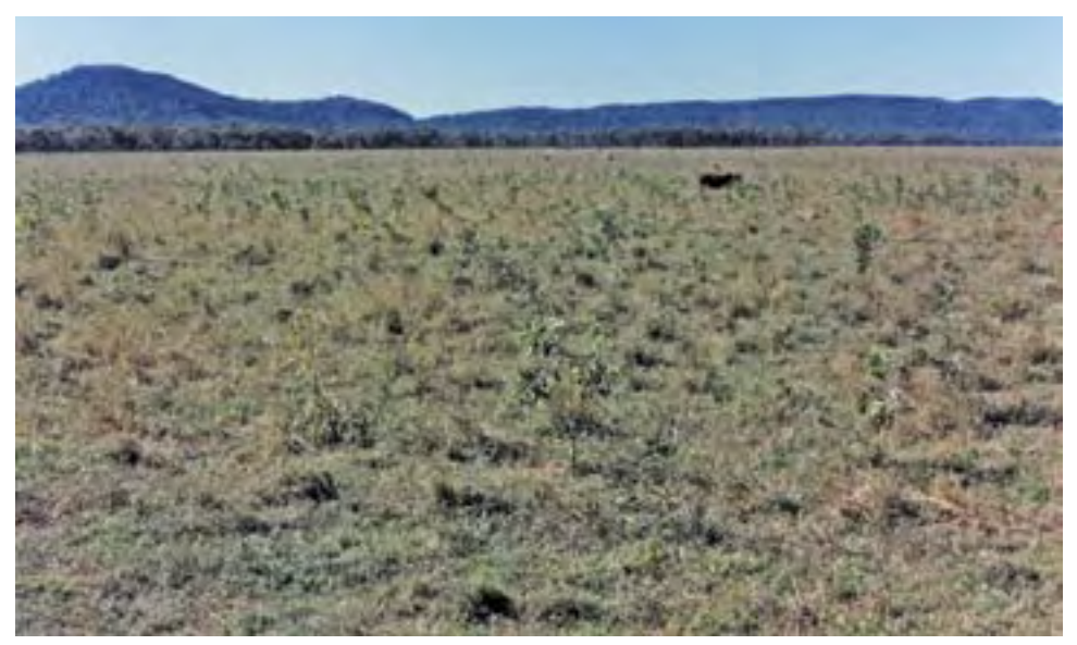
Developed coastal tea tree country with emerging tea tree regrowth problem