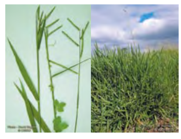
Brachiaria decumbens (syn. Urochloa decumbens) cv. Basilisk (1966)