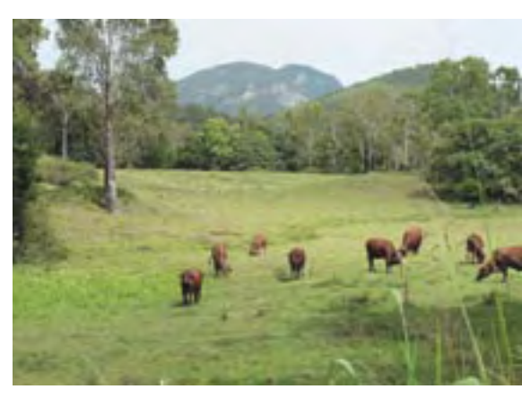
Sown pastures in Seaforth area on coastal rainforest land type, with high range in background.

Recommended conservation management: Existing rainforest vegetation has high conservation value as habitat for threatened flora and fauna species include rufous owl, Proserpine rock wallaby, burrowing skink and endemic ground-dwelling lizards. Remnant areas should be fenced for controlled grazing and fire management to protect remnant edges.