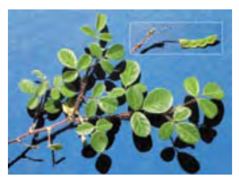
Desmodium heterophyllum cv. Johnstone (1971)

Hetero is a perennial tropical legume that is compatible with vigorous