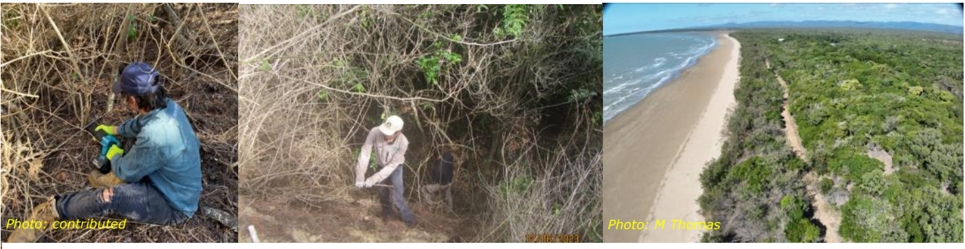
SLCMA & PCL Field staff cut/pasting lantana

The Threatened Ecological Communities project was supported by Reef Catchments through funding from the Australian Government's Reef Trust.