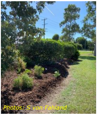
Fresh mulch on the gardens

The change of season from hot sticky madness of summer to cooler calm is upon us. Much nicer weather for gardening.