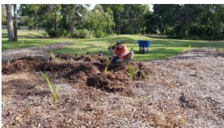
Larissa planting 'Frogmouth'

A new garden bed has recently been added to our community garden. We have named it the Boomerang Garden due to its shape. This is quite a wet spot, so we are planting species that love these boggy conditions; Broad-leaved paperbark ( Melaleuca viridiflora ), Cabbage tree palm ( Livistona decora ), Frogmouth ( Philydrum anuginosum ) and Crinum lily ( Crinum pedunculata ); are some of the species recently added. While these