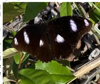
Male Eggfly butterfly ( Hypolimnys sp.) in the gardens

plants thrive in wetter conditions, they also cope well during the dryer months. We look forward to these plants growing and creating a new display for visitors to the gardens.