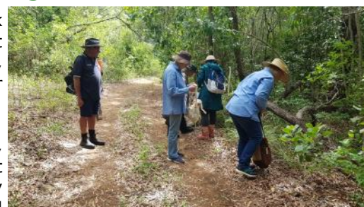
SLCMA Volunteers seed collecting

As announced in our last newsletter, our nursery will be expanding, and phase 1 has begun! The water treatment train currently located at the rear of the nursery has been dismantled and set in a temporary location until a new setting is constructed on the proposed extended site. We will give you an update on phase 1 in the next newsletter.