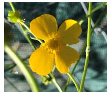
Flower of Ranunculus lappaceus

Notes: Common in damp areas, roadsides, drainage ditches etc.