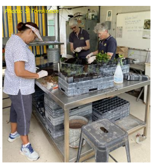
SLCMA Volunteers potting-on seedlings

If you would like to volunteer in your local community and meet new people while learning local native plants and their propagation, come along to the SLCMA Community Volunteer morning, every Wednesday, 9am to 12noon. For more details contact SLCMA on 4956 1388. SLCMA Community Volunteer Program is proudly supported by Mackay Regional Council, Natural Environment Levy.