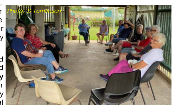
Volunteers enjoying our volunteer Christmas party!

If you would like to volunteer in your local community and meet new people while learning local native plants and their propagation, come along to the SLCMA Community Volunteer morning, every Wednesday, 9am to 12noon. For more details contact SLCMA on 4956 1388. SLCMA Community Volunteer Program is proudly supported by Mackay Regional Council, Natural Environment Levy.