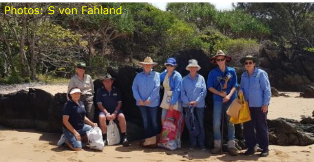
Left & Right: Volunteers at Freshwater Point

Lovely to see the volunteers in the nursery every Wednesday morning, keen to assist with the nursery activities. A couple of seed collection outings were also well supported by the volunteers. We made our way to Freshwater Point on a couple of occasions exploring some different tracks and found a few species in seed that we could return to the nursery with, for cleaning and propagating.