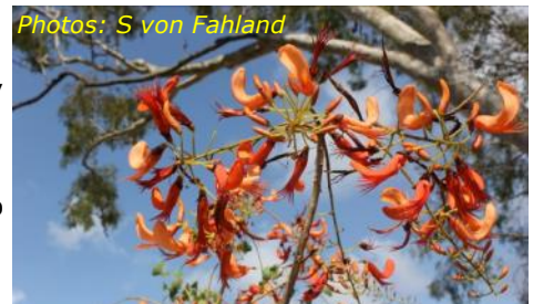
Top: Flowers; Below: Leaves of Bat's wing coral tree

Information sourced from: Melzer & Plumb (2007) Plants of Capricornia