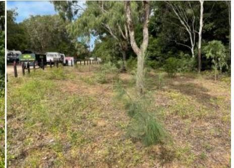
Site 2: Before & after initial weed control