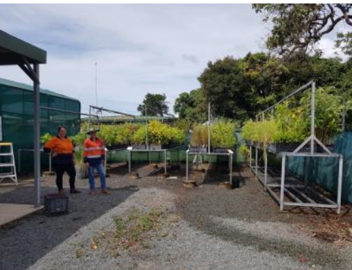
Moving benches in the nursery

The nursery has had another re-shuffle with plant benches in the sun hardening area being shifted in preparation for 3 new benches to be installed and an upgrade of the irrigation system. Many thanks to Alana and Darrin for their assistance shifting plant trays, benches and irrigation. We have also installed an extra blind to provide more shade to the covered workspace. Thanks to Neil and Pete for their help making this happen. Thanks again to the volunteers for your continued assistance with seed cleaning, sowing, potting on, weeding tube stock and providing the nursery officer Susie with company and conversation. Your support is appreciated.