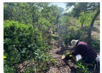
Above: Volunteers getting stuck into weeding one of our revegetation areas and planting native species.