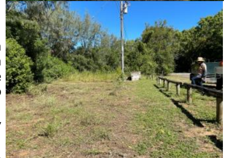
Site 1: Before & after initial weed control